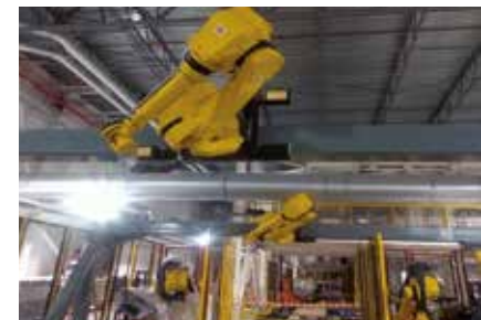
Installation of P250 robots NISSAN Aguascalientes