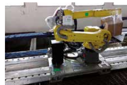
Installation robots in SMR GIFFIN San Luis Potosi