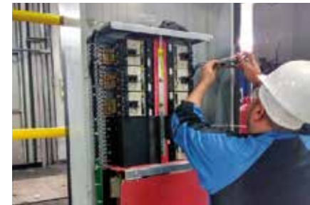
Installation of P700 robots in Agave project