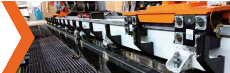
Escobedo Nuevo León NAVISTAR